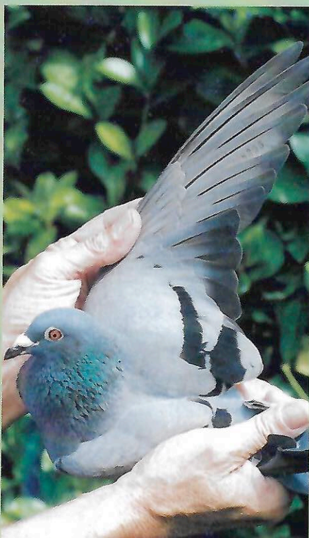
The wing of 'Aline', 1st National La Souterraine.